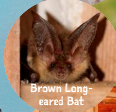
Brown Long-eared Bat

The North Slob is also a hare sanctuary, founded to protect the Irish Hare, a distinctive race of the European Mountain Hare. At least nine species of bat have been recorded here.